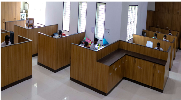
Staff working area